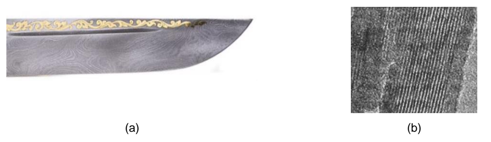
Fig. 2. (a) - Damascus steel sword and (b) - Damascus steel nanostructure

properties. Nanotechnology introduces an understanding of nanoscience to create new materials, structures or devices using nanoscale properties.