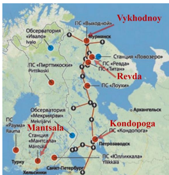
Figure 1. The layout of the measuring devices: red circles - the registration of the GIC, blue circles - the location of magnetometers.

Fig. 1 shows location of the points of registration of the GIC and the location of magnetometers.